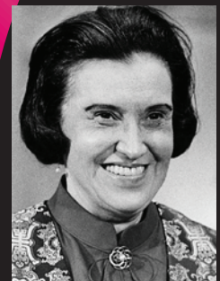
Rosalyn Yalow (1977)

Unlock your access to our Legacy Collection today