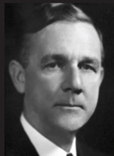
George Whipple (1934)