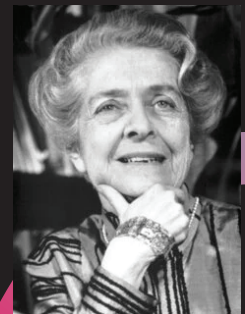
Rita Levi-Montalcini (1986)