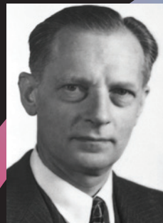
Carl Cori (1947)